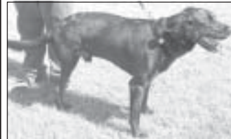
"Claude" - Male Black Lab, 5 yrs. old