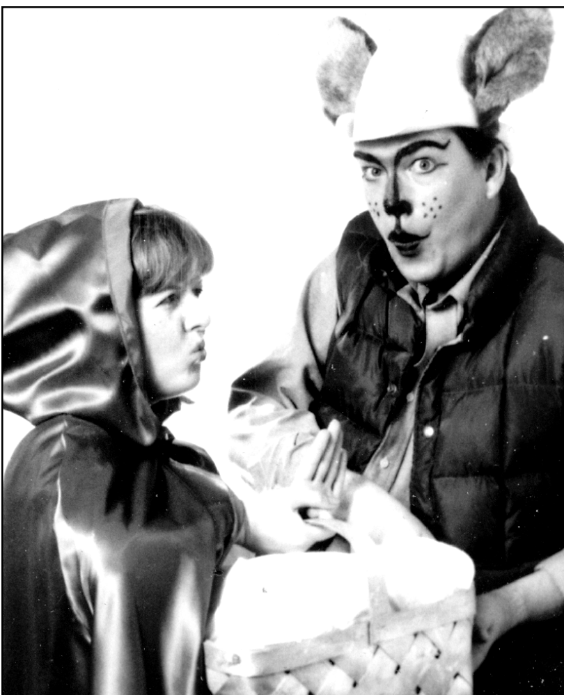
LITTLE RED RIDING HOOD will play at area schools.

There were 14 girls at the meeting and Molly brought treats.