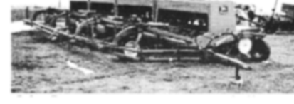
John Deere 4-section 9300 grain drills, 8-12" spacing w/ transports