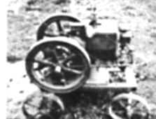
McCormick Deering engine, 1-1/2 H.P. speed 500 No. AW8950

Antique forge Iron wagon wheels Several antique school desks Slate blackboards