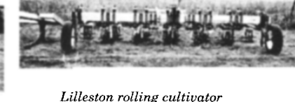
Lilleston rolling cultivator