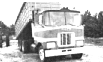
1966 Mack Tandem Twin Screw, 5X3 transmission, 10:00 R 20 rear tires, 11-22.5 front tires, Midwest all-steel box, roll-over tarp, twin cylinder, Woods hoist.

1948 Ford truck, good for restoring 1956 Buick, 4-door Special, for parts 1947 Chevrolet truck, needs work