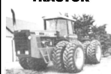
1990 Ford Versatile 876, manual shift, 4 hydraulics, 20.8X38 duals, 5,078 hrs., field ready.