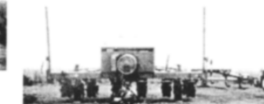
Case 900 Cyclo Planter, 6-row milo-sunflower drums