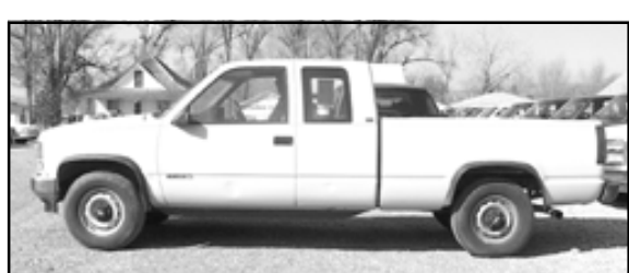
'90 Chevy 1/2-ton 4x4, 350 V-8 $4,900