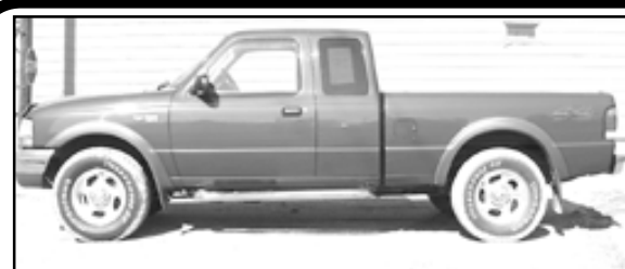
'99 Ford Ranger Super Cab 4x4, Excellent Shape $15,900

Looking for an ambitious, self motivated, hard working Sales Person to sell new & used vehicles. Benefits include: * 401k Plan * Health Insurance * Great Pay * Life Insurance * Paid Vacation * Demo Plan Apply in person to Mark HOWARD KOOL HONDA McCook, NE 210 West 3rd - 308-345-3600