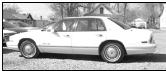
'96 Buick Park Avenue, 3800 V-6, A Sharp Car! $7,950