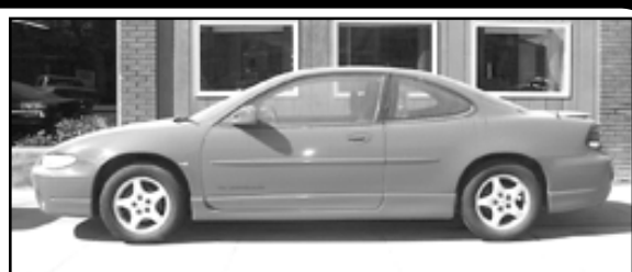
'97 Pontiac Grand Prix GT 3800 V-6, Sharp 1-owner $12,200