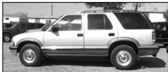
'95 Chevy S-Blazer, 4300 V-6, Loaded LS $9,500