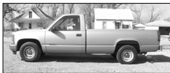
'96 Chevy 1/2-ton 2WD, Nice & Clean $6,950