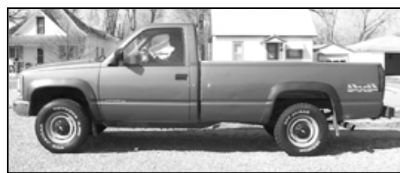
'94 Chevy HD 3/4-ton 4x4 6.5 Turbo Diesel $7,500