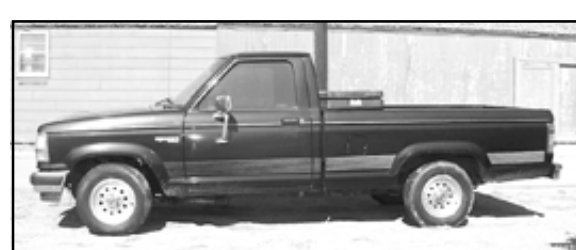
'91 Ford Ranger 2WD, Fuel Economizer $3,500