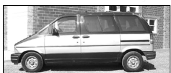
'88 Ford Aerostar V-6 $1,250