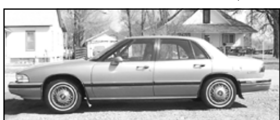
'92 Buick LeSabre LTD, 3800 V-6 $2,750