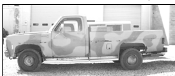
'80 Chevy 3/4-ton 4x4, 400 V-8 $1,500