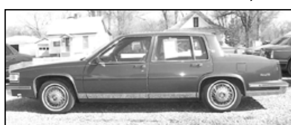
'88 Cadillac Sedan DeVille Loaded & well-cared for $2,500