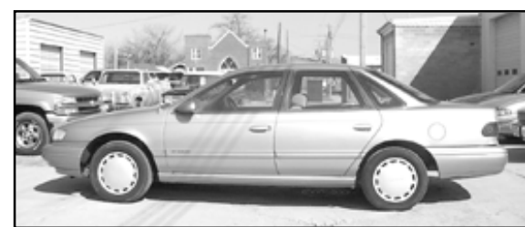
'95 Ford Taurus GL, V-6, Loaded $4,200