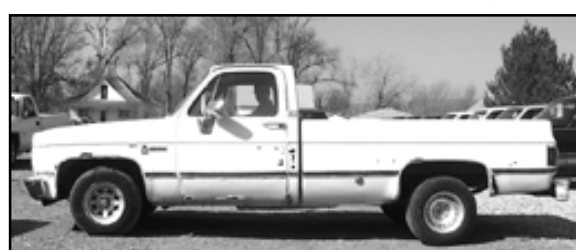
'83 Chevy 1/2-ton 2WD, V-8, Auto 1,250