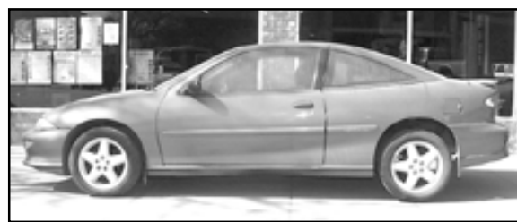
'96 Chevy Cavalier Z24 29K, Nice $9,750