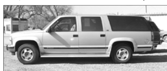
'93 Chevy Suburban 4x4 FI 350, V-8 $11,500