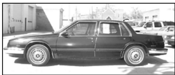
'89 Buick LeSabre Custom, 3.8 V-6 $1,950