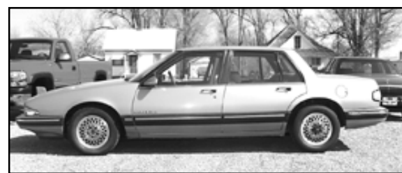
'90 Pontiac Bonneville, 3800 V-6 $2,950