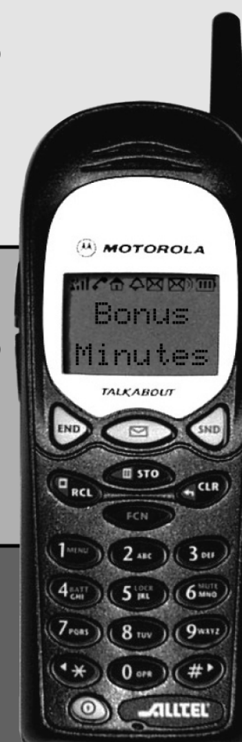
Motorola T2260 $49

NIGHTS & WEEKENDS WITH EITHER PLAN, FOR LIFE