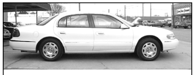
1999 Lincoln Continental. Full size luxury, extra, extra nice car, just 12,000 miles.