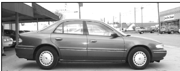
1998 Buick Century Limited. Top-of-the Line car, full power, dual temp controls & more. 22,000 miles

Full Service Shop 3 Technicians to Serve you.