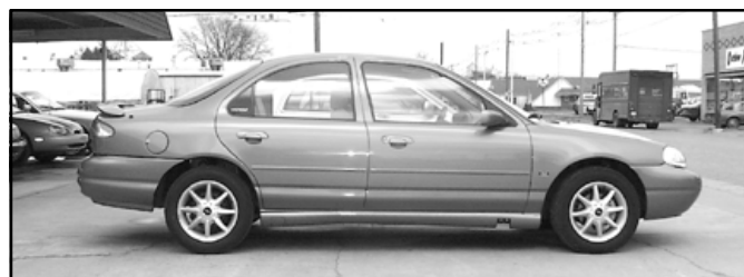
1999 Ford Contour Sport. Neat, neat car, V-6 full power, moon roof and only 25,000 miles