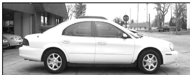
2000 Mercury Sable LS. All the right equipment, including power seat. Just 10,000 miles.