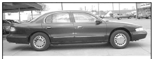
1997 Lincoln Continental. Excellent car, lady-owned, dark jewel green, tan leather interior, 32,000 miles