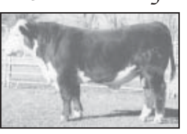
Thick, stout, high-performance cattle have