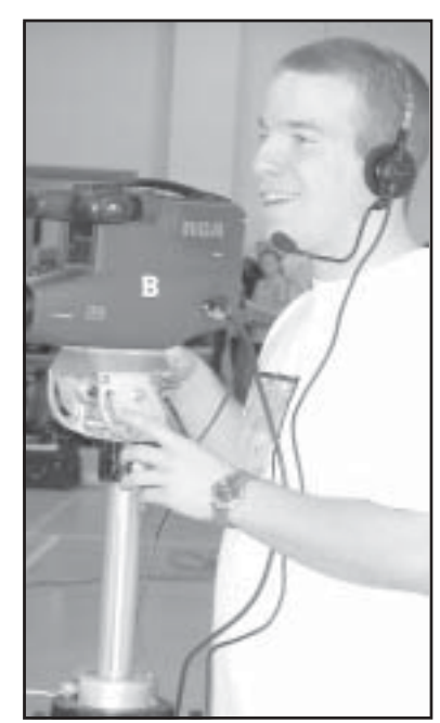
Join me at the Telethon!

Don't forget to watch "Seeds of Hope" on the Oberlin Community Access Channel 7, from 1 to 10 p.m. Saturday. Come on up to The Gateway to watch, sample the sloppy Joes, hot dogs, chips, pie and chili soup and make your donation in per-