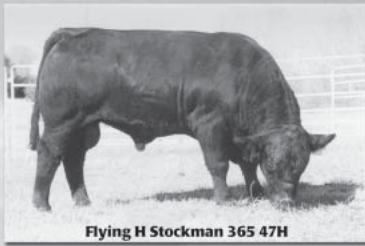
Flying H Stockman 365 47H

Red Angus Sires Include: Cherokee Canyon Hi Ho 753 Schuler No Equal H542