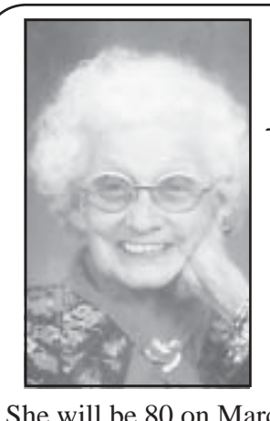
She will be 80 on March 20. Her mailing address is 7515 Cook Ave., Citrus Heights, CA 95610