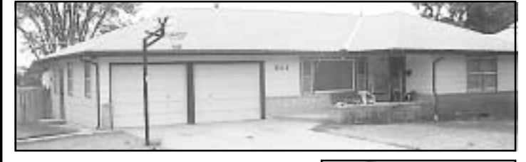
Beautiful ranch home, full finished basement, double car garage plus 24' x 40' detached garage.