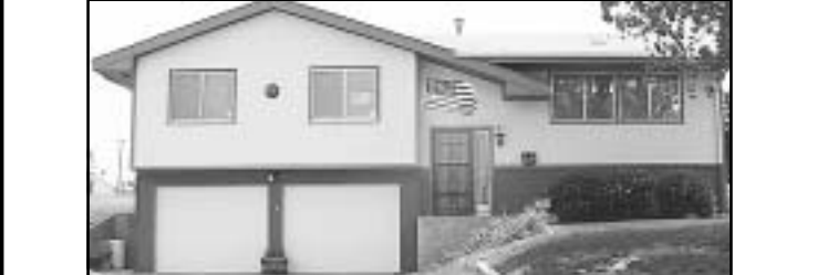
Spacious 4 bedroom, 2 bath split-level sited on 3 lots. Amenities include deck with hot tub and gas grill, high-efficient central air-heat, gourmet kitchen plus much more!

Call us today about our newly listed homes!