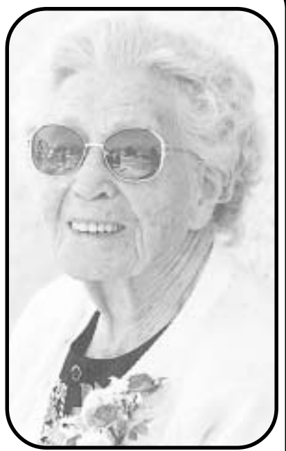
We Love You Grandma

Cards will reach her at: 105 S. Rodehaver Oberlin, KS 67749