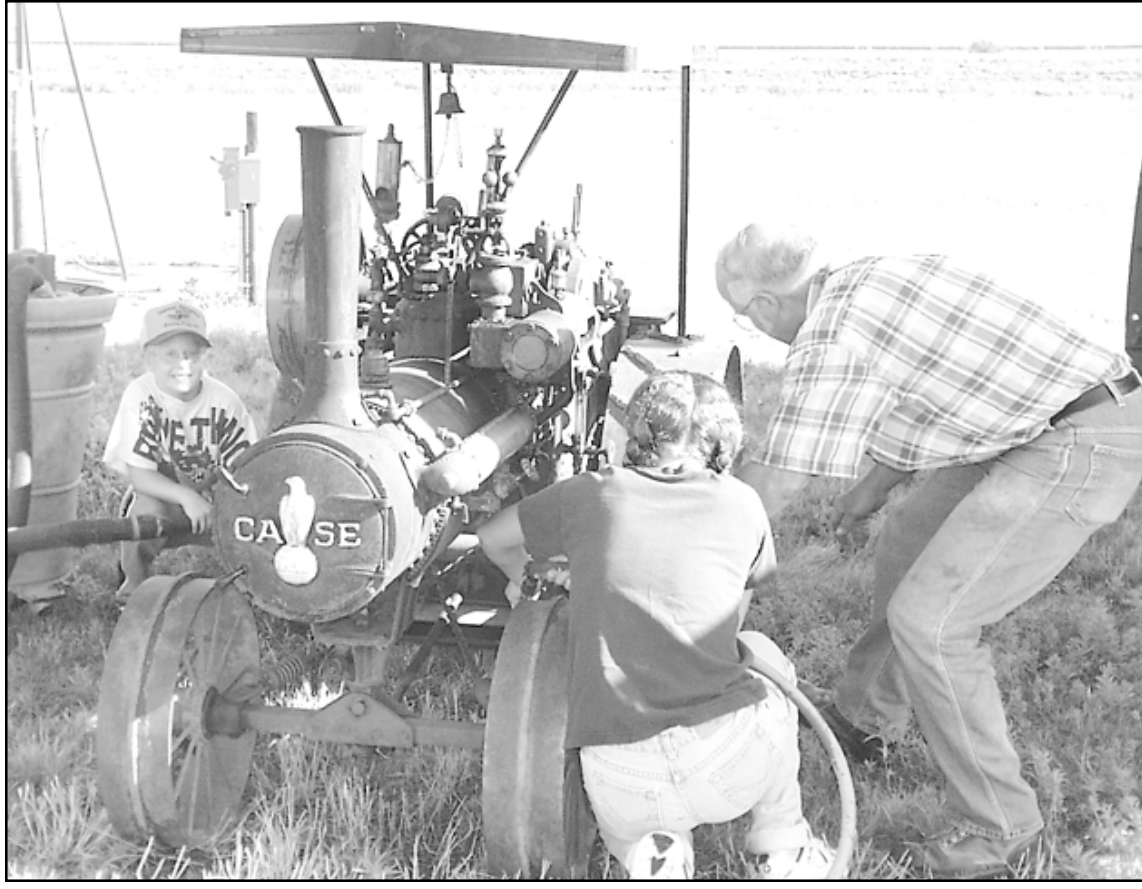
IT TAKES THE HELP of young and old to get the equipment ready for the Tri-State Antique Engine and Thresher Show held in Bird City each year. Shown is a miniature model of a steam tractor.