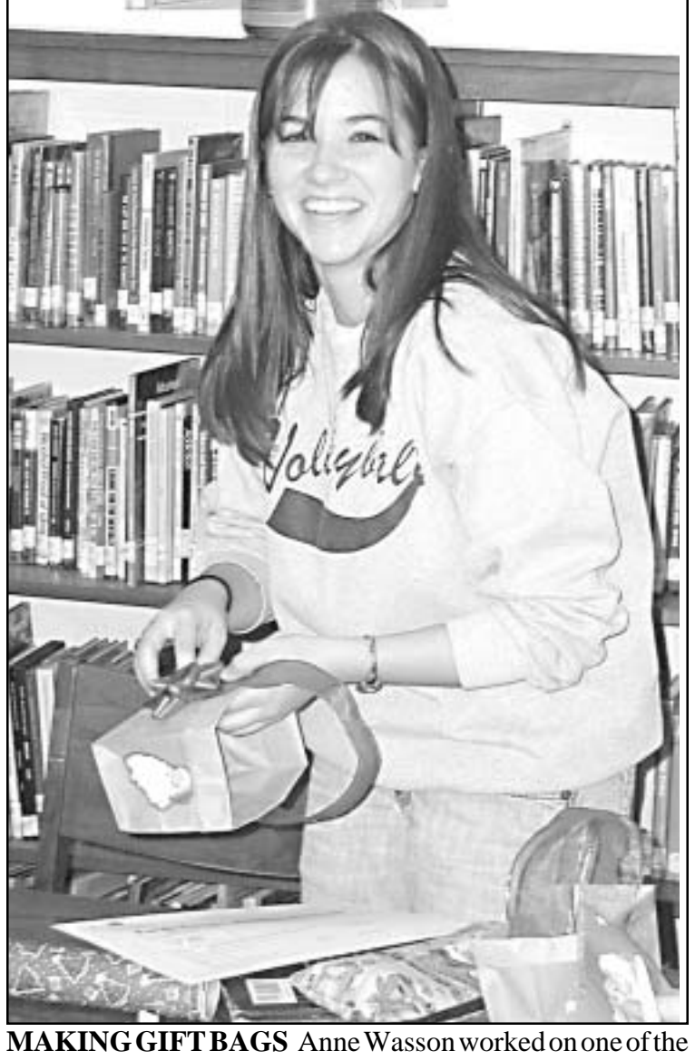
- Dictator staff photo