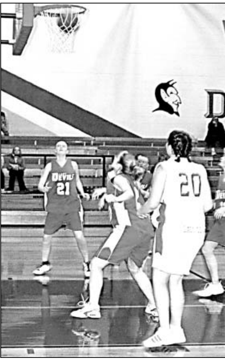
THE DECATUR COMMUNITY HIGH basketball girls (above) waited for the ball to fall through the basket. The boys played keep away during the annual food scrimmage last Tuesday.