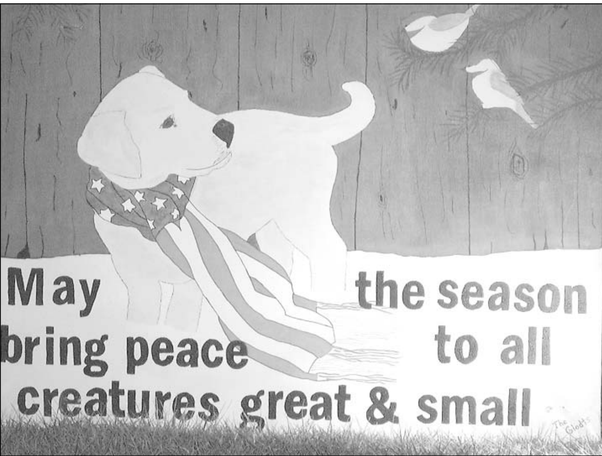
A GIANT WOODEN hand-drawn postcard (above) has a spotlight on it in front of Sue and Kelly Glodt's house west of the hospital. A large white polar bear (below), dressed in a blue sweater and hat, sat next to a large green tree in the Kevin Ketterl backyard on West Coldren Street.