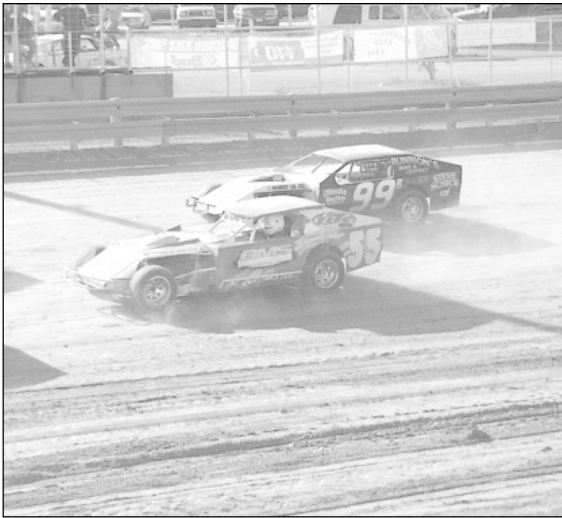
to increase the school district's local option budget by 5 percent. The local tax share of the district's general-fund budget was at 13.11 percent and the state allows school boards to increase up to 25 percent. With the increase, the board went to 18.11 percent. (See 2003 on Page 10A)