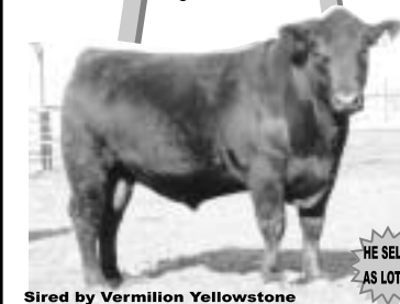
Sired by Vermilion Yellowstone ALL BULLS are Fertility Tested and Ultrasounded for Marbling, Fat & Ribeye Area