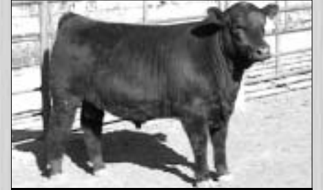
tor 035ZFM sold to Horsley Cardinal Angus JSAR Mr Do Horsley Bros

• 50 Extra Stout 2-Year-Olds • 50 Carcass-Superior Yearlings of Popular Pedigreed Outcross Genetics These stout JSAR bulls sold last year. Don't miss out on this year's crop!