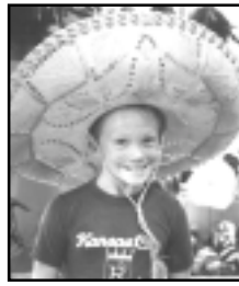
We're proud of you kid.