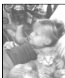
You'll do well. We love you.

Submit a childhood photo and caption (10 words or less) of your graduating senior to be included in the Graduation Special Edition. Contact Dave Bergling at The Oberlin Herald for all the details.