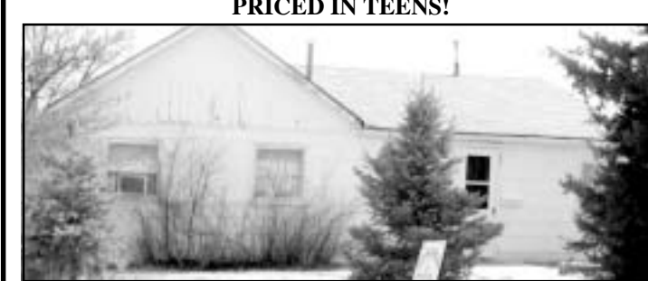
This 3 bedroom home includes large eat-in kitchen with nice cabinets, bath and laundry on main floor plus basement with large bedroom, kitchenette, living room and bath. Also includes 2 storage sheds