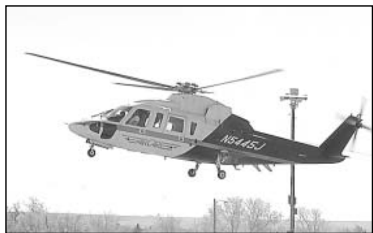
AN AIR AMBULANCE HELICOPTER from Kearney, Neb., landed in the grass next to the parking lot at The Gateway just before 11 a.m.

Other years, she said, the weather has been bad and they haven't been