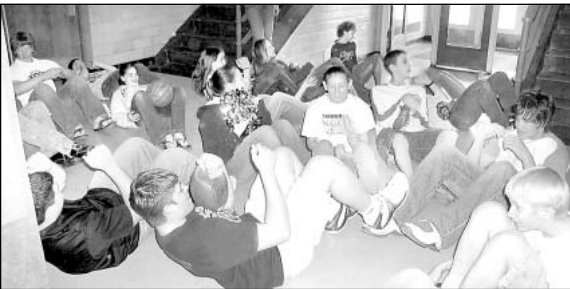
D-CLUB INITIATES do push-ups and sit-ups in front of a crowd during home room.