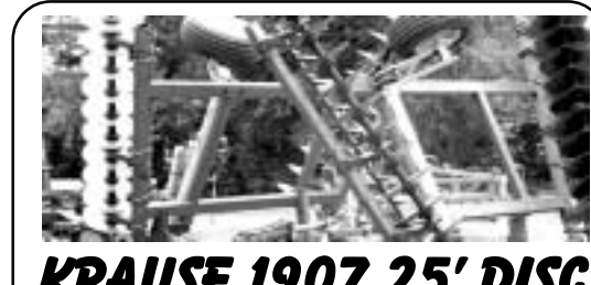
KRAUSE 1907 25' DISC Good Blades, Good Shape