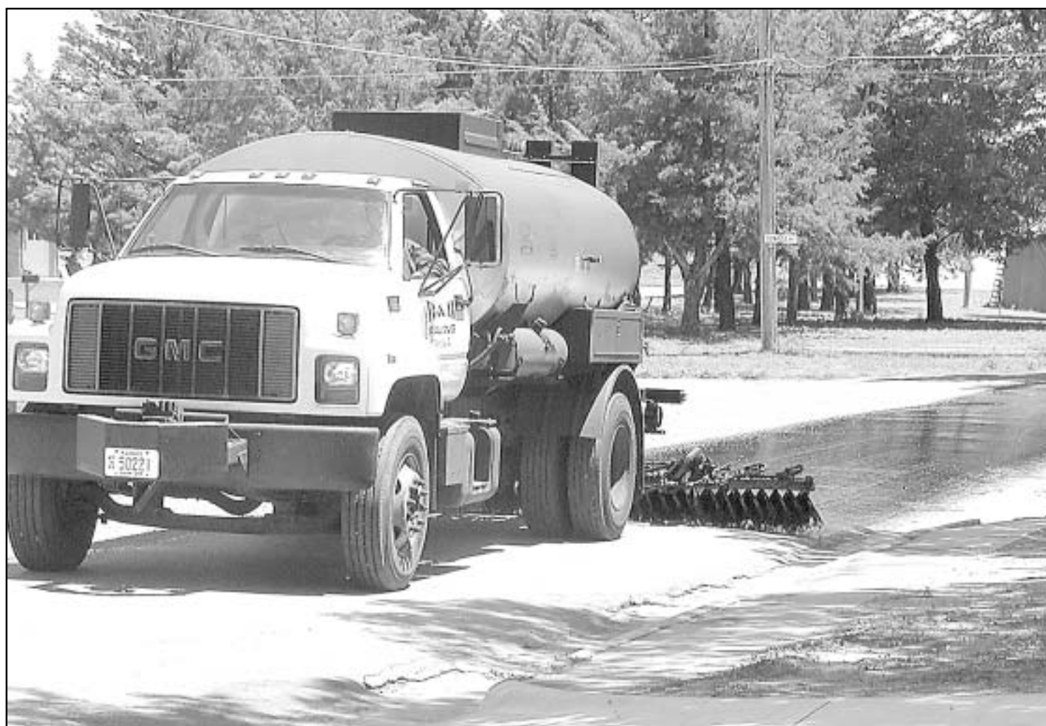
LAST WEDNESDAY , a crew with B&H Paving sprayed oil on the streets (above) with a large truck and then a machine came in and dumped sand over the oil (below). The crew did the east/west streets in town, finishing the job on Thursday.

The sheriff's office is sending letters out again for bids from companies in-state for a vehicle.