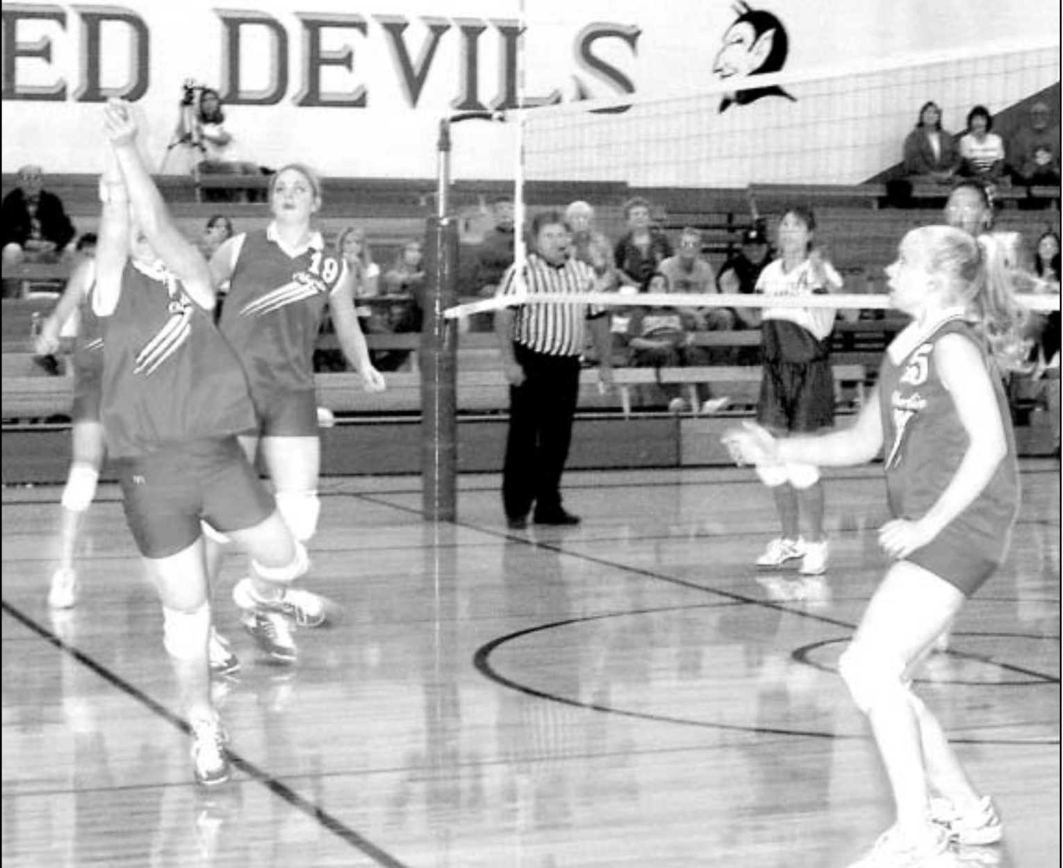
THE OBERLIN LADY DEVILS had a fine season last year, they defeated both the St. Francis Indians (shown here) and ending their drive by taking second at substate. In October, the Cheylin Cougars.