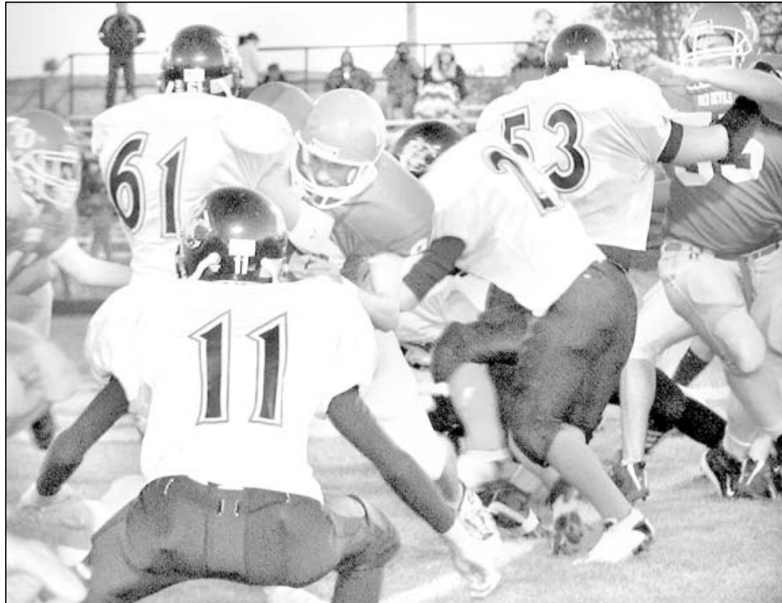
be ready to play. The kickoff will be THE RED DEVILS and the Rawlins County Buffaloes Devils downed the Buffaloes 34-0. clashed during Oberlin's Homecoming game on Friday. The

The Red Devils are now 2-3. Next week the team will travel to Oakley to take on the Plainsmen. The Plainsmen were 4-0 until Goodland beat them last week, so they should at 7 p.m.