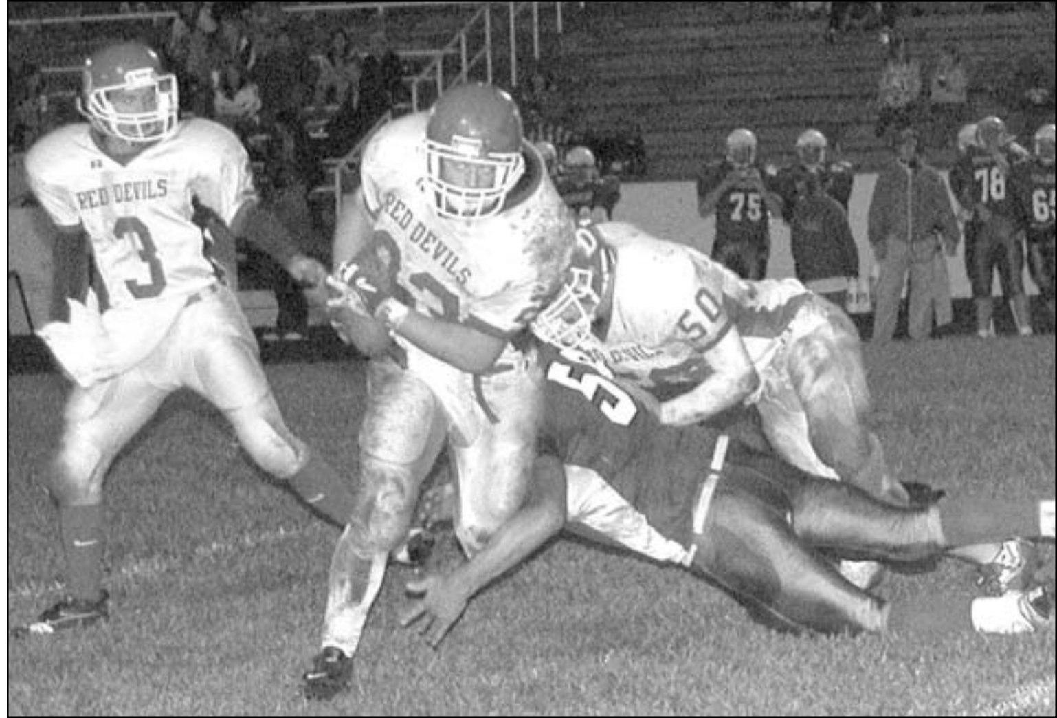
AT THE FIRST DISTRICT GAME Friday night in Stockton, the Red Devils showed they were able to play like a

The program is sponsored by Western Plains Arts Association.