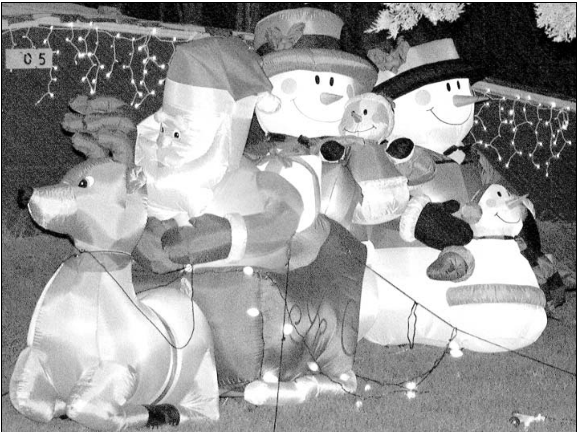
SANTA AND HIS REINDEER , Frosty and family decorated this yard (above) at the top of North York Avenue for the holidays. In the grass outside the Decatur County Good Samaritan Center sat a basic manger scene (below) with Joseph, Mary and Jesus made from wood and painted white.