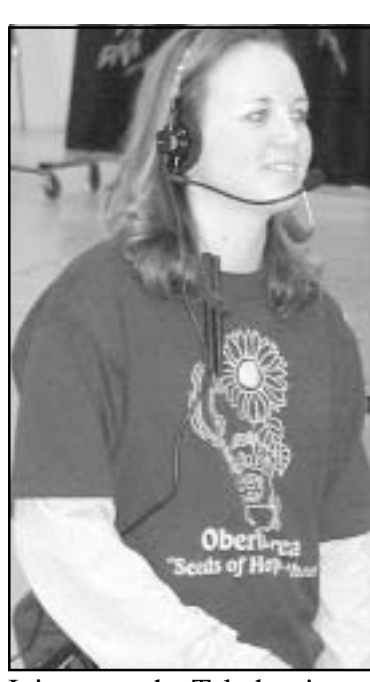
Join me at the Telethon!

Saturday, Feb. 5 1-10 p.m. at The Gateway, Oberlin or on Local Access Channel 7 10 Years of making a difference in Decatur County!