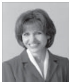
Lynn Jenkins, CPA Kansas State Treasurer

"Each year $12 to $15 million worth of new unclaimed money & property is added to our database. Find out if any belongs to you or your friends and family! Contact my office today at no cost to you - regardless of the claim amount!"