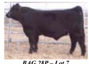
BAG 28P - Lot 7

Updated information including ultrasound data, scrotal circumference, and performance data will be available sale day as well as on-line at www.springvalleyfarms.com