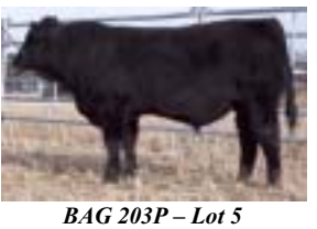
BAG 203P - Lot 5

CATALOG WILL BE ONLINE AT: www.springvalleyfarms.com