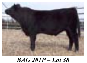
BAG 201P - Lot 38