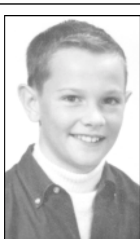
Lookin' fine at 49 — not!!