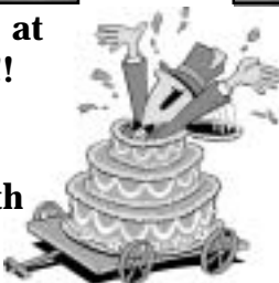
from KK KH SK