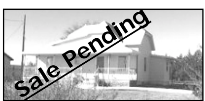
2.5 Acres with 3 bedroom home