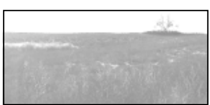
10 Acres with well Close to Oberlin