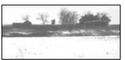
6 Acres, small building Near Jennings