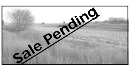
17 Acres of bottom ground