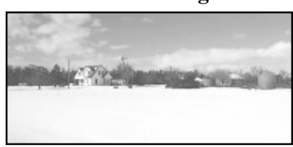
9 Acres with 1 1/2 story home & outbuildings