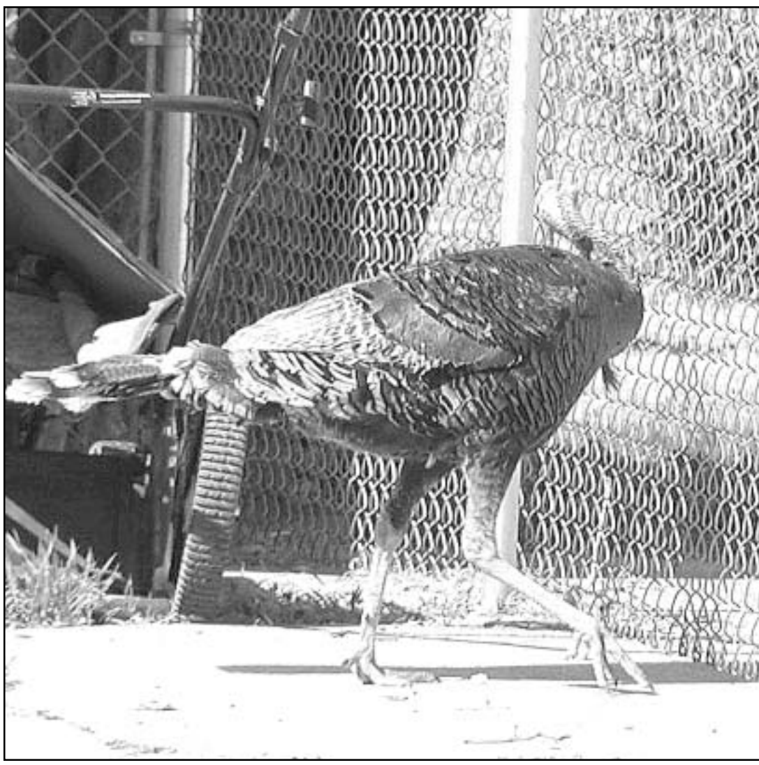
A CONFUSED GOBBLER tried to find a way through a chain link fence between houses on Rodehaver Avenue last week. The wild turkey was part of a flock that has been seen roosting in trees southwest of downtown Oberlin.