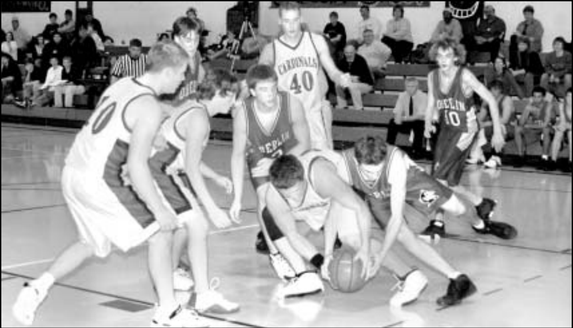
THE OBERLIN RED DEVILS went after a loose ball during their subdistrict game against the Plainville Cardinals on Feb. 28.