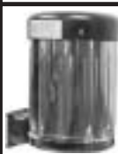
U.S. and Franklin motors

June Special! Gearboxes to fit your Valley $195.00!