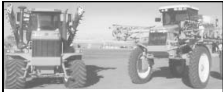
See us for your fertilizer and chemical needs.

124 S. Penn — Oberlin, Kansas — 785-475-2296