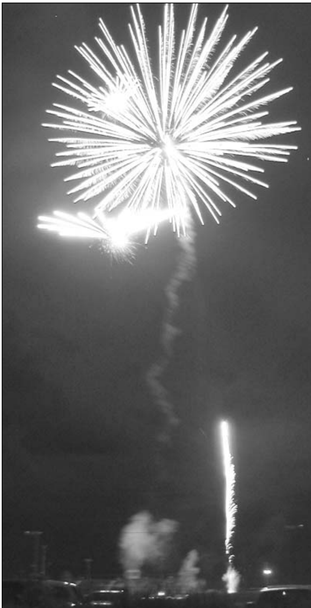
AT THE FAIRGROUND Monday, people lined up in the grandstand and parking lot to watch the fireworks display sponsored by the Oberlin Business Alliance. The show, complete with colors and loud booms, lasted about 30 minutes.