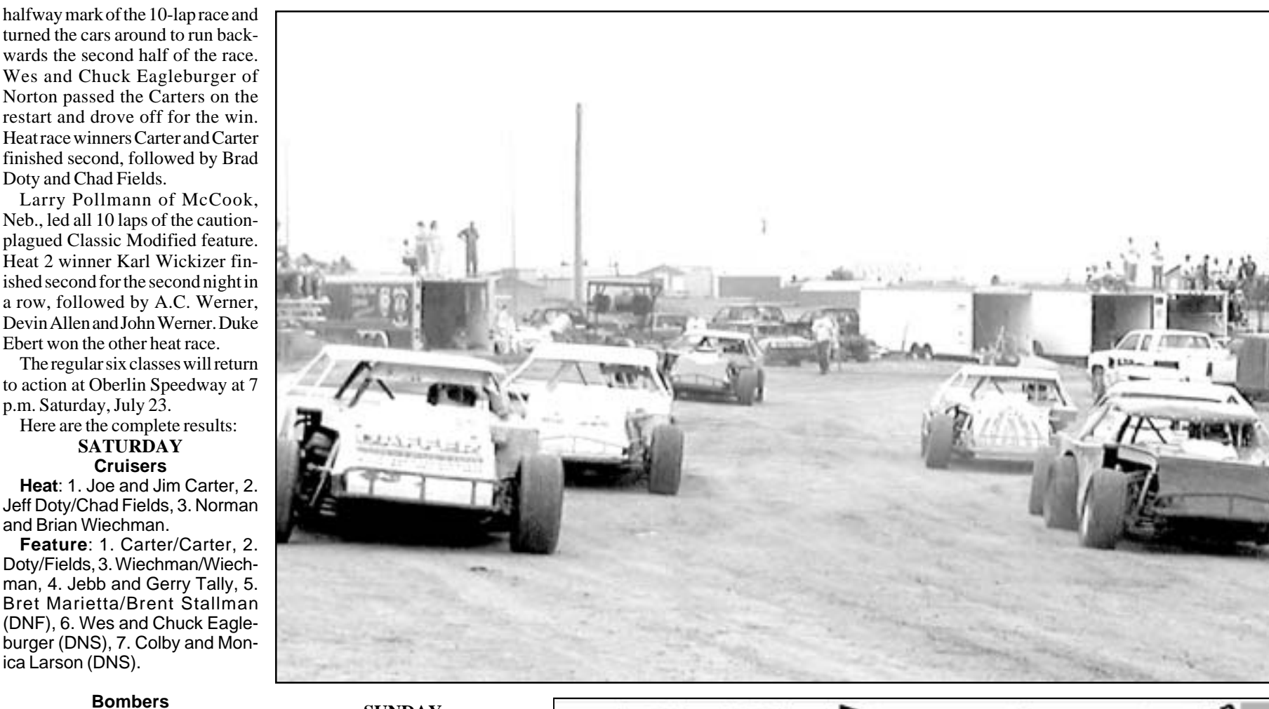
IMCA HOBBY STOCK RACERS (above) rounded a turn at the Oberlin third. As the hobby stocks finished their race, the IMCA modified cars (be