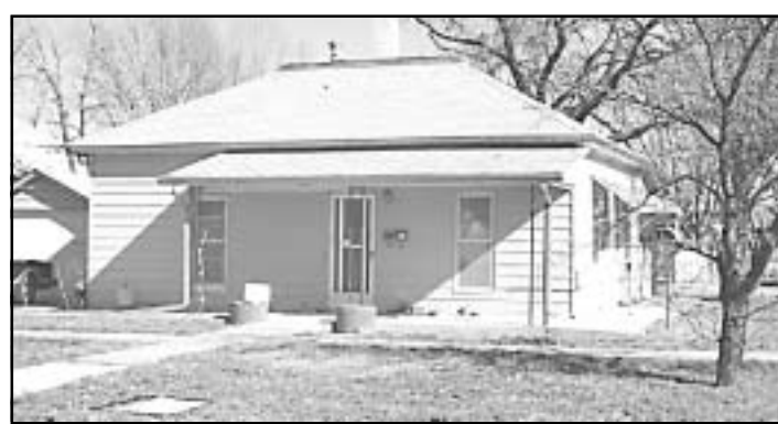
123 S. CASS - PRICE REDUCED TO $15,000. Quaint Victorian cottage with 3 bedrooms, living/dining room, single garage.