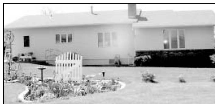
307 N. INGALLS - 4 bedroom, 2 1/2 bath, fireplace, family room, main-floor laundry/office, formal dining room, lush lawn, oversized double detached garage/workshop plus single garage and garden shed.