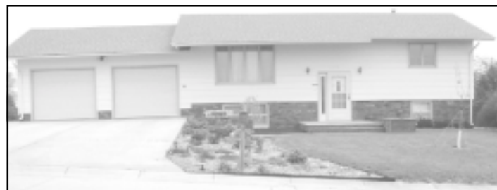
109 N. WOLF - 4 bedroom, 3 bath split-level sited on 3 lots surrounded by evergreens, family room, L-shaped open dining/living room, double attached garage plus single garage/workshop, large deck.