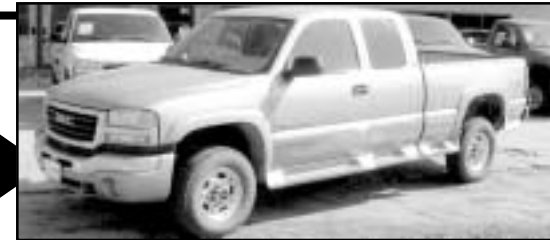
04 GMC Sierra 2500 HD Ext Cab 4WD, 4DR SLT, 6.0 V8, HD Trailer Pkg., 19k, Leather & Loaded! Sale $25,900