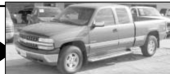
99 Chev Silverado 1500 Ext Cab SB 3DR 4WD LS, 5.3 V8, AT, HD Trailer Pkg., 80k, Loaded! Sale $14,900