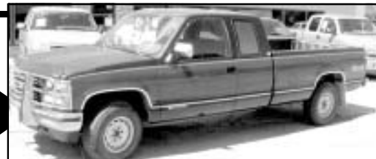
89 Chev K20 LD Ext Cab LB 4WD Silverado, 350 V8, AT, AC, Local Trade! Sale $3,900