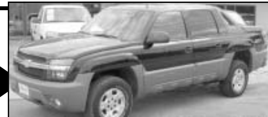
02 Chev Avalanche 1500 4WD Z71 5.3 V8, Cloth, HD Trailer Pkg., 38k, Loaded! Sale $21,000