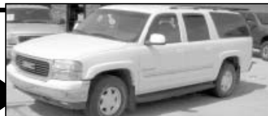
03 GMC Yukon XL 1/2T 4WD 5.3 V8 (E85), Cloth, Rear AC, HD Trailer Pkg., Remaining GMPP, Nice! Sale $23,900