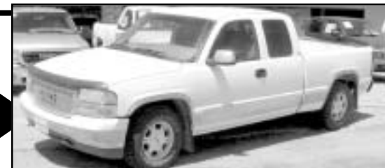
02 GMC Sierra 1500 Ext Cab 2WD SLE, 5.3 V8, AT, HD Trailer Pkg., Local Trade! Sale $12,900