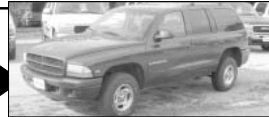
99 Dodge Durango 4DR 4WD SLT, 5.2 V8, Rear AC, 3rd Seat, Nice Local Trade! Reduced $8,500