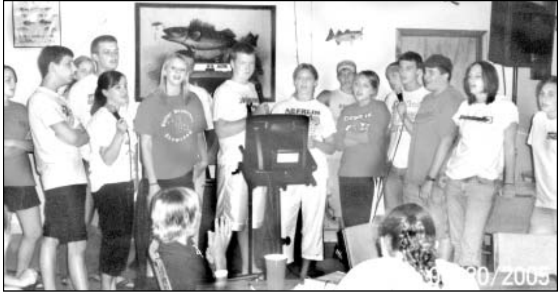
SHOWING OFF THEIR TALENTS, the DCHS Singers had fun doing karaoke at their annual retreat held this year at Red Willow Lake in Nebraska.

Monday: Breakfast: cereal, muffin, peaches. Lunch: ham, scalloped potatoes. Tuesday: Breakfast: pancake and sausage on a stick, tropical fruit. Lunch: chili dog, nachos. Wednesday: Breakfast: sausage/ egg/cheese biscuit, Mandarin oranges. Lunch: chicken fried steak, roll with butter. Thursday: Breakfast: waffle, ham patty, pears. Lunch: turkey and cheese sandwich. served with all lunches.