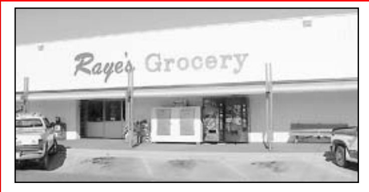
Raye's 🐗 Grocery Inc.