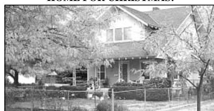
222 E. COMMERCIAL. Two-story stucco Bungalow w/open staircase, 3 spacious bedrooms, 1-1/2 baths.