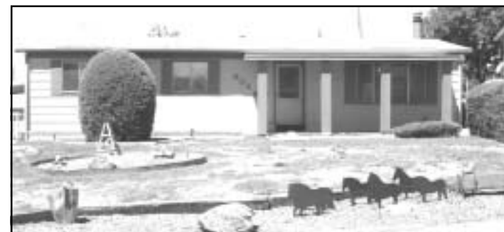
604 N. WILSON. Three bedroom modular, eat-in kitchen, woodburning fireplace, beautifully landscaped front and back yards.