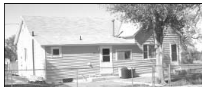
Price drastically reduced on this house in Norcatar. Two bedrooms plus office on main floor, large living room and dining room; full basement with family room, bedroom and bath.