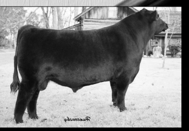
Featuring the progeny of 2-time Nat'l Champion & breed leading performance sire Hot Rod!

Selling sons of Hot Rod, OCC Doctor, OCC General, JSAR Enterprise 70, EXT, New Design 878 & War Hall of Fame.