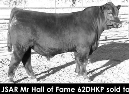
D&L Cattle, Ohio