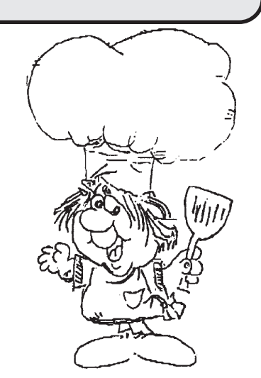
meals. Choice bar served with all

Friday: Breakfast: cereal, muffin, apricots. Lunch: pizza, green beans, apricots. Milk served with all