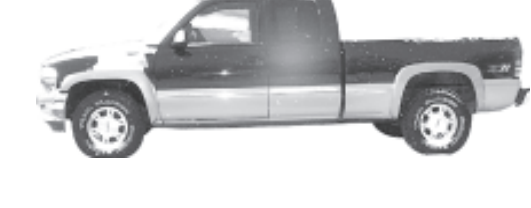
2000 GMC 1/2T. Short Box 3rd door, leather, 4x4, new tires, 90,000 miles, Sharp Truck! $10,995