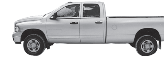
2004 Dodge Ram 3500 Diesel, 6-speed, 4x4, SLT, power seat, CD, 50,000 miles. $27,995