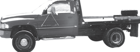
1995 Dodge 1-Ton Dually 4x4, flatbed, 5-speed, diesel. $7,995