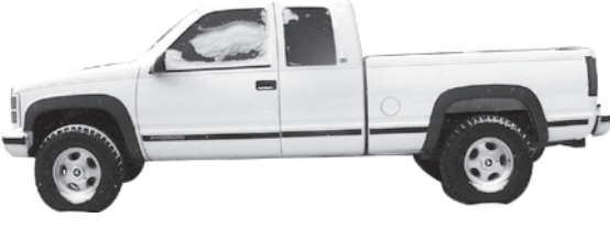
1997 GMC 3/4T. Short Box 4x4, automatic, 454 engine, Very nice truck. $8,995