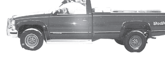
1992 Chevy 3/4T. Reg. Cab 6.5 Turbo Diesel, 4x4, good tires, clean. $3,995