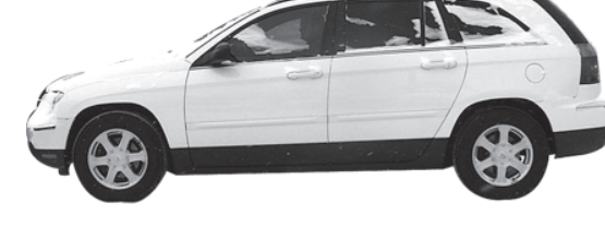
2005 Chrysler Pacifica All-wheel drive, leather, satellite radio, rear A/C and heat. $20,995