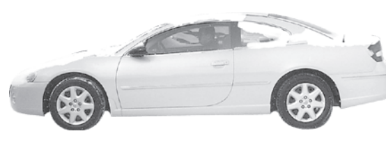
2005 Chrysler Sebring 2-door, stone white, CD player, factory warranty. $12,995