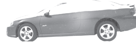
2005 Dodge Stratus RT 2-door, steel blue, leather, sunroof, spoiler,, factory warranty. $15,995