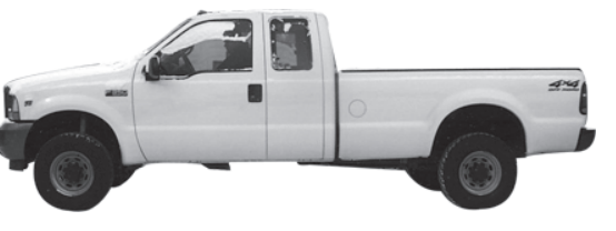
2002 Ford F-350 Quad Cab Long box, 4x4, V10, 6-speed. This truck is straight. $10,995