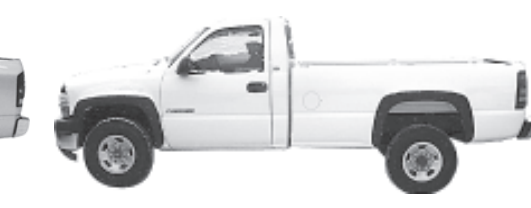
2001 Chevy 2500 H.D. Regular cab, 4x4, 5-speed, 6.0, V/8 new transfer case. $10,995