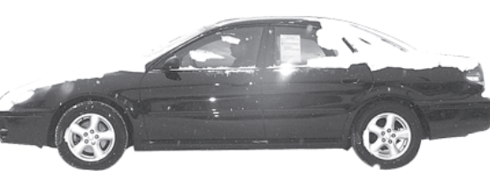
2004 Ford Taurus SE 4-door, V/6, wheels, power seat, CD, Excellent car!. $6,995