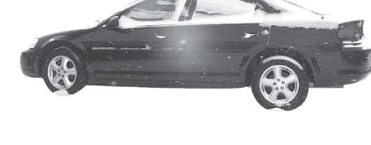
2005 Dodge Stratus SXT 4-door, patriot blue, power seat, wheels, V/6. $12,995