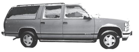
1999 Chevy Suburban LS Gold, 4x4, new tires, one-owner, unit, Excellent service history. $7,500