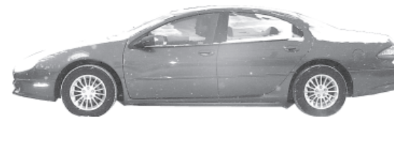
2004 Chrysler Concorde LXI 4-door, leather, power seats, CD, Clean car! $10,995