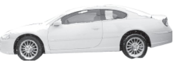
2005 Chrysler Sebring Limited 2-door, stone white, leather, sunroof, factory warranty. $15,995