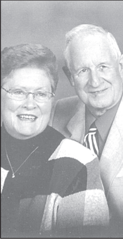
50th Wedding Anniversary

The public is welcome. A reception will follow.