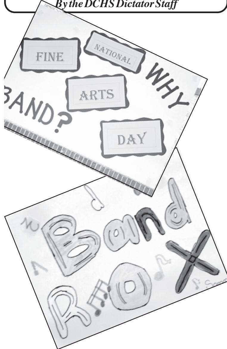
SUPPORTING THE FINE ARTS , junior high band students made and put up posters to promote their program during National High School Activities Week, Oct. 15-21.